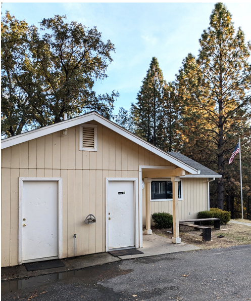
We are hoping to expand our high school building. Read more on back page.

At the end of the month we hosted the 42nd Agony Ride. As always, it was an intense and impactful weekend of selfless, sacrificial service together. We had 59 first time riders and 139 riders total,