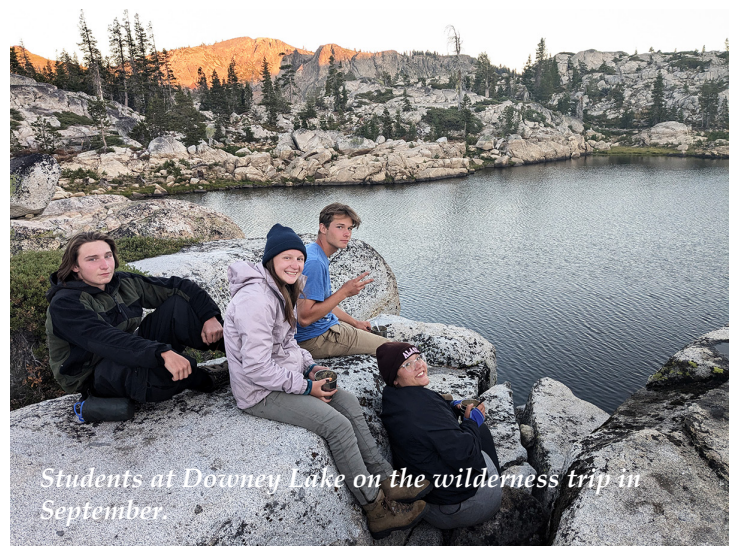
Students at Downey Lake on the wilderness trip in September.

At the end of August, the camp season began to slow. This year 18 groups used Angels' Meadow, including churches, college ministries, family camps, youth retreats, and more. We share these facilities at no charge, and it's a joy to hear stories of how the Lord worked in each group. Thanks to volunteers, a variety